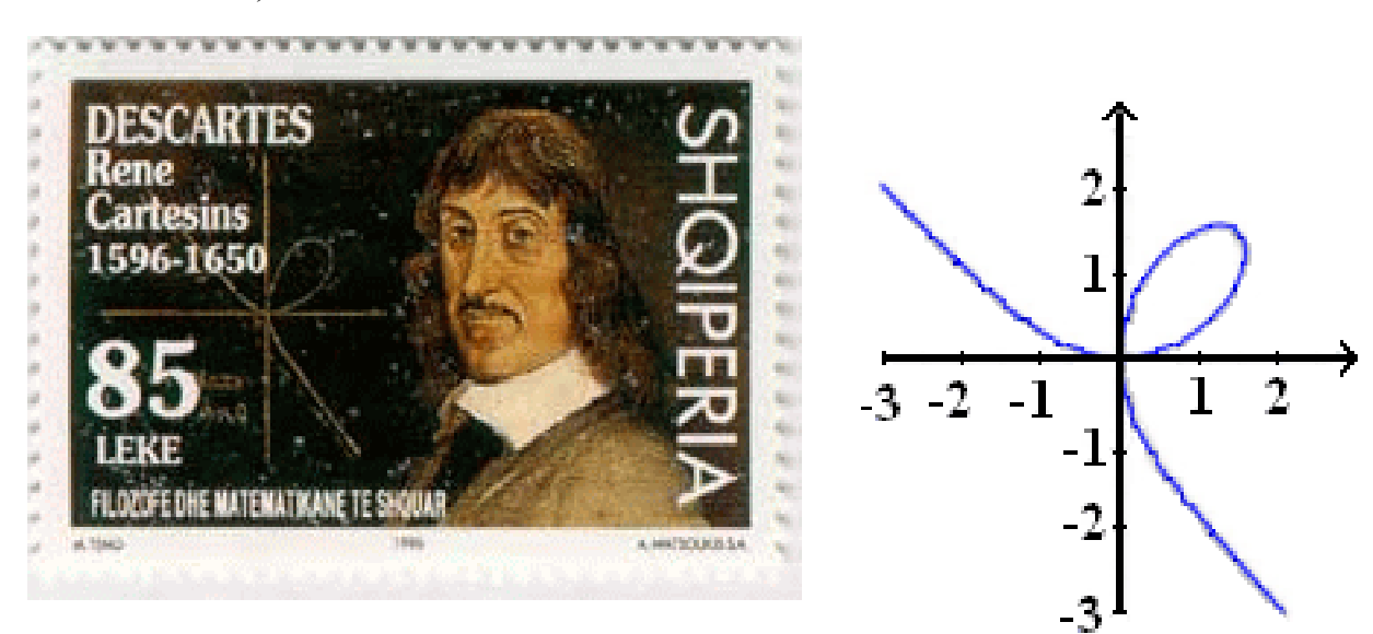
Figure 1. This stamp with a graph of the folium was issued by Albania in 1966.

Descartes was first to discuss the folium (leaf in Latin), which he discovered in an attempt to challenge Fermat's extremum-finding techniques, in 1638. Descartes challenged Fermat to find the tangent line at arbitrary points. Fermat achieved success immediately, much to the chagrin of Descartes. In French the Descartes Folium is sometimes called the noeud de ruban , or in German - Kartesisches Blatt.